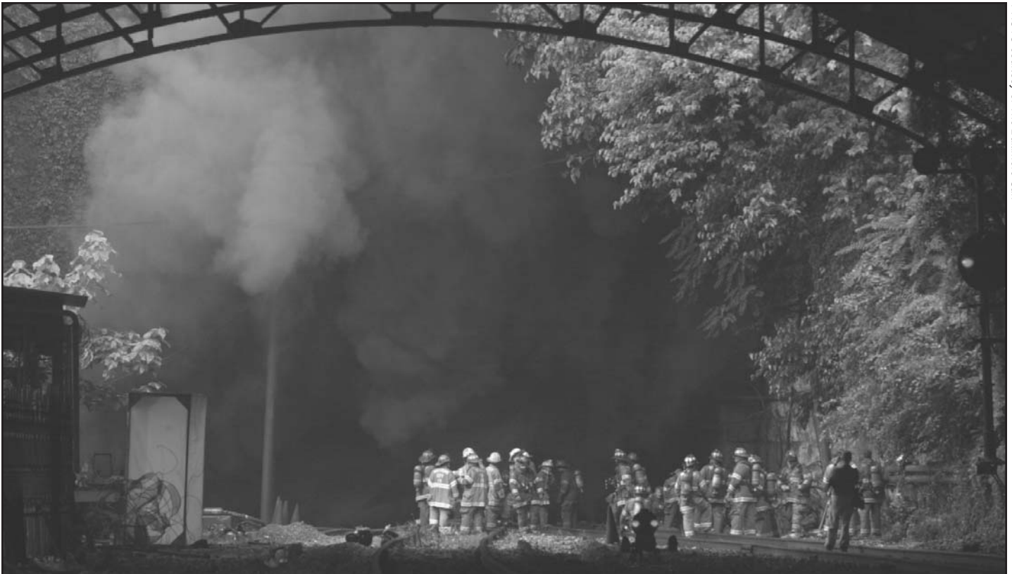
Firemen outside Howard Street tunnel in downtown Baltimore

could do. A state environmental official was quoted saying that air monitors at both ends of the tunnel had picked up no whiffs of either acid or other “compounds of concern.”